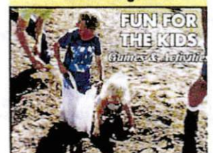
FUN FOR THE KIDS Games & Activities

Thresherman's Dinner Specialty & Ag Vendors Pie Auction • Train Rides Working Sawmill Blacksmith Shop Gardening Demonstrations Great Food Displays by collectors of All Ages!