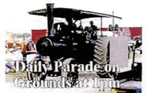
Daily Parade on Grounds at 4pm

Thresherman's Dinner Specialty & Ag Vendors Pie Auction • Train Rides Working Sawmill Blacksmith Shop Gardening Demonstrations Great Food Displays by collectors of All Ages!