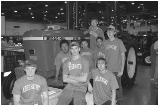
Abernathy, Texas FFA team with restored JD 4440.