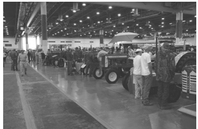
Some of the tractors, restored by students, on display in the Houston Exhibition Hall.

Chuck (tractor poor) Bos (Continue next month)